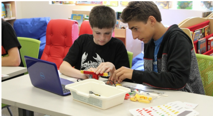
Middle School Students work on building their latest Snapology creation