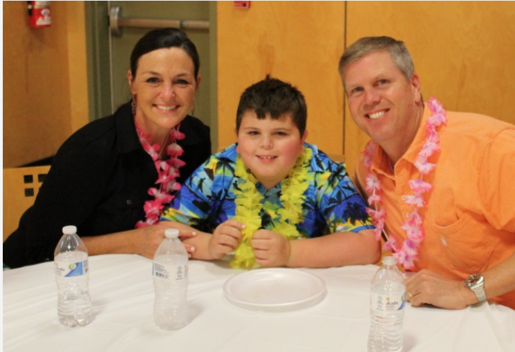
Students and families enjoyed a night of fun at our WSPO Hawaiian Dance!