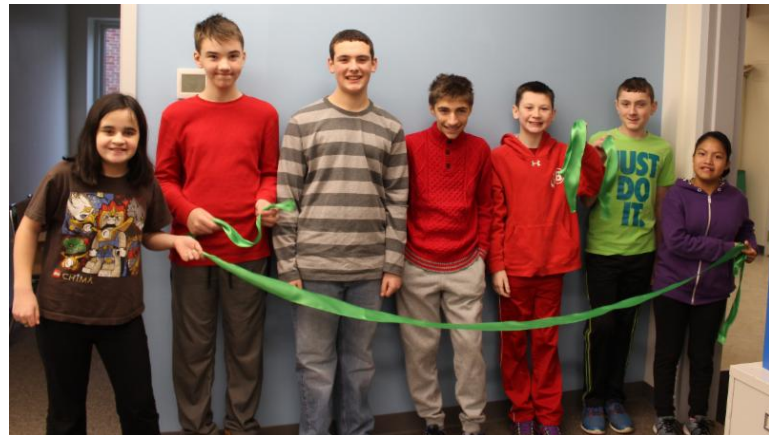
Room 6 students cut the ribbon on their new classroom!

The ribbon has been cut and Room 6 is settling nicely into their new classroom! With construction of the classroom completed in December, students and staff were able to move into their new space once they returned from Winter Break. On the first morning back, Room 6 students and families celebrated with a ribbon cutting ceremony, complete with sparkling cider and muffins!