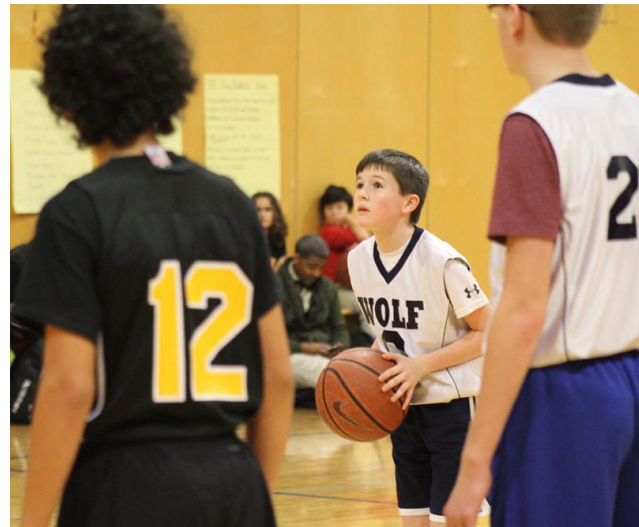
Wolf Basketball team at their recent game

Check out photos of our fantastic team here !