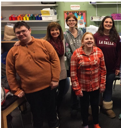
Recent Alumni join current 8th Graders

One of our beloved traditions at The Wolf School is our Recent Alumni Pizza Party. Current 8th Grade students are joined by the graduating class of the past two years, to catch up, connect, and enjoy some pizza! It provides our 8th Grade students a great opportunity to hear from former Wolf students currently in high school as they themselves begin this next part of their educational journey.