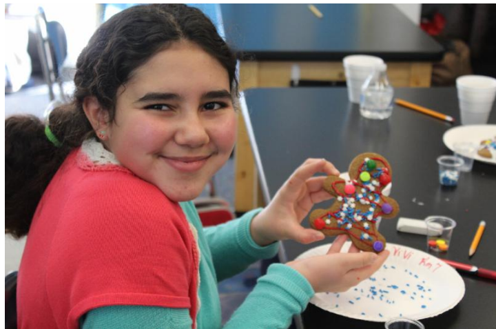
Students get into the holiday spirit!

The Wolf School is lucky to have such an engaged parent organization! Before break, the WSPO graciously donated a new Bose Sound System to the school, just in time for our Holiday Event! They also brought some festive fun to every classroom! Our students had a blast decorating gingerbread with friends while enjoying hot chocolate! To see photos of the fun click here . Thank you to our WSPO for always going above and beyond for our students and our school!