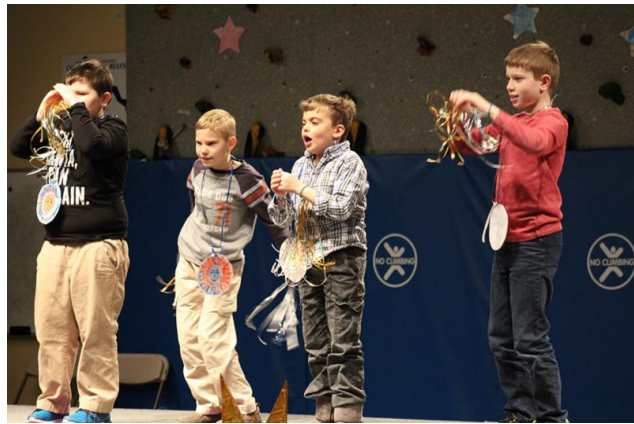
Students perform at our annual Holiday Event!

As all of us know, getting up in front of a crowd is never easy. But imagine how impossible it might seem if you were a child with complex learning challenges? When they first arrive at Wolf, many of our students don't yet have the social skills or confidence it takes to speak up in class, much less perform in front of a full audience. This is why our annual Holiday Event is so much more than a school concert - it allows us to see how far our students have come and how well they are thriving! You can't help but beam with pride when you see those same students who couldn't participate in class take the stage and perform their hearts out with confidence and courage!